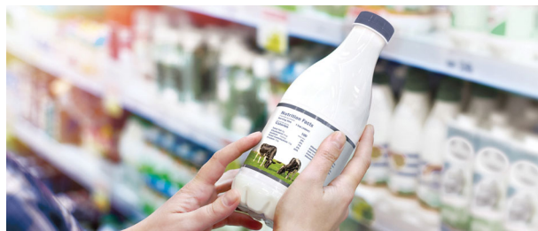
PACKAGING MATERIAL SOLUTIONS