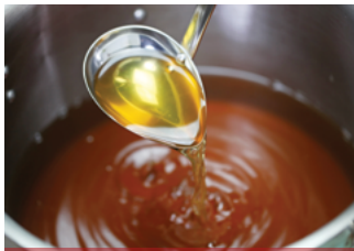
Broth & soup