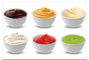
Dips & specials