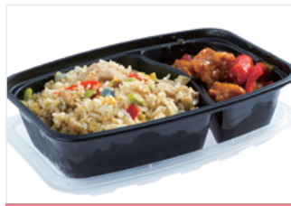
Meals in trays